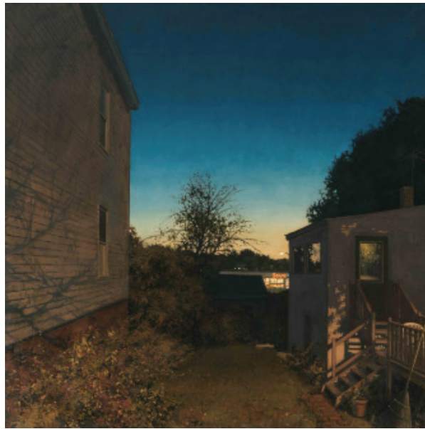
Linden Frederick, Save-A-Lot , 2016, oil on linen

- Ellen Gamerman, The Wall Street Journal